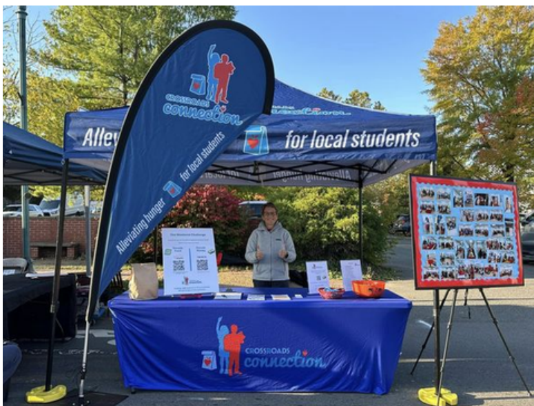
The Crossroads Connection Haymarket Day Booth

Haymarket Day is one of our big annual community events. This year was especially outstanding. Haymarket Day featured spectacular weather, thousands of people in attendance, and countless outstanding programs and products shared with the public. This was especially true for Crossroads Connection. Throughout the event, booth volunteers handed out hundreds of flyers and gratefully accepted cash donations, which will go toward the purchase of food. We met a number of groups who have donated funds and expressed interest in conducting food drives for us.