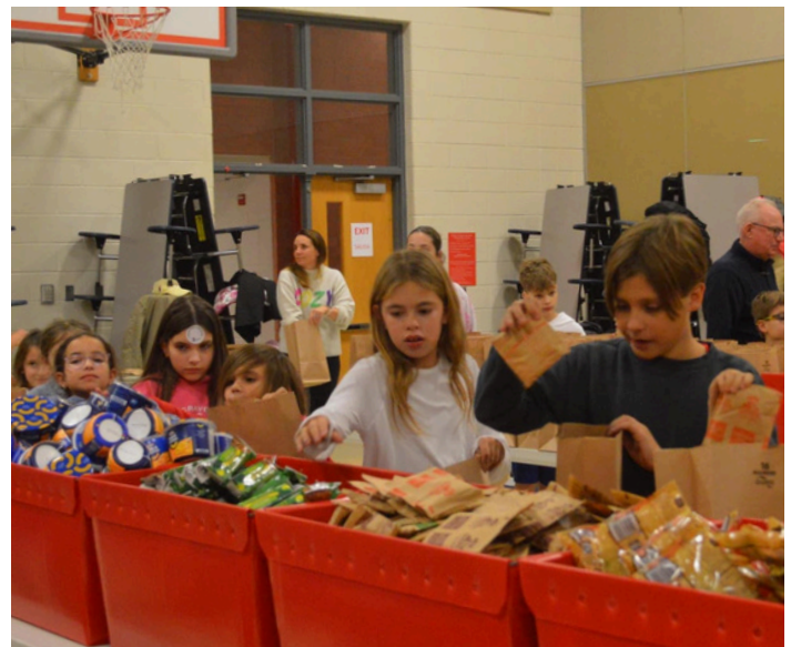
Gravely Elementary School Packing Event